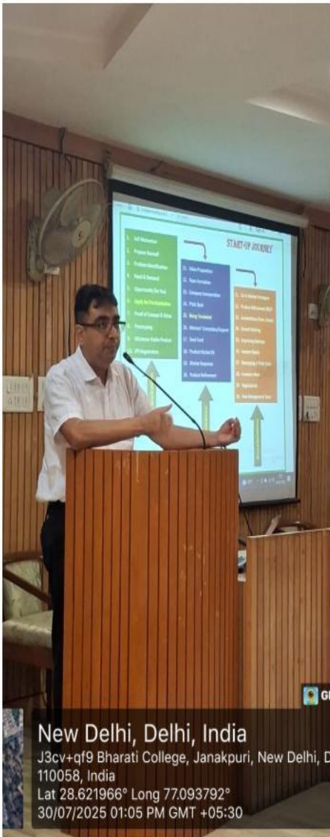
New Delhi, Delhi, India J3cv+qf9 Bharati College, Janakpuri, New Delhi, D 110058, India Lat 28.621966° Long 77.093792° 30/07/2025 01:05 PM GMT +05:30