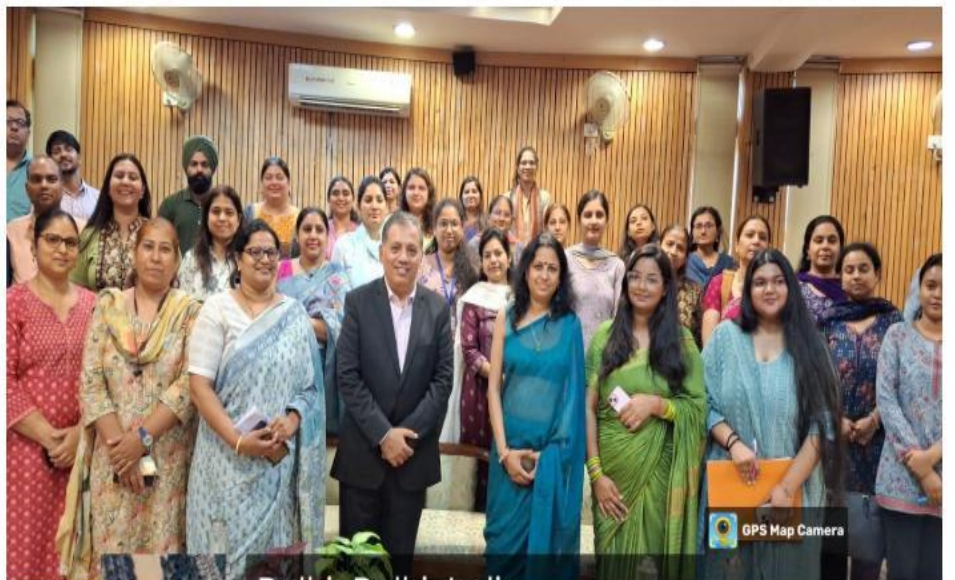
GPS Map Camera