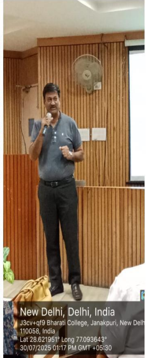
New Delhi, Delhi, India J3cv+qf9 Bharati College, Janakpuri, New Delhi 110058, India Lat 28.621951° Long 77.093643° 30/07/2025 01:17 PM GMT +05:30