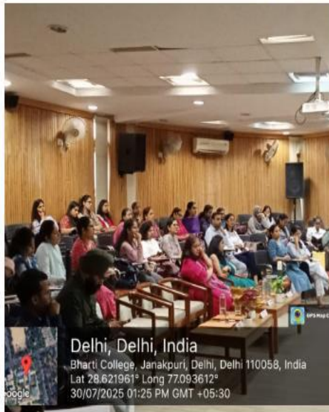
Delhi, Delhi, India Bharti College, Janakpuri, Delhi, Delhi 110058, India Lat 28.621961° Long 77.093612° 30/07/2025 01:25 PM GMT +05:30